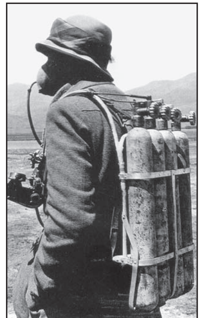
An oxygen supply is crucial to climbing Everest. Early equipment was cumbersome.

Fluid buildup in the lungs and brain is also a threat. For reasons not well understood, lower air pressure causes fluid to leak from tiny blood vessels, called capillaries , in